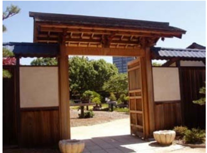
The Mas Gate and entrance to the Bonsai Collection at Lake Merritt.